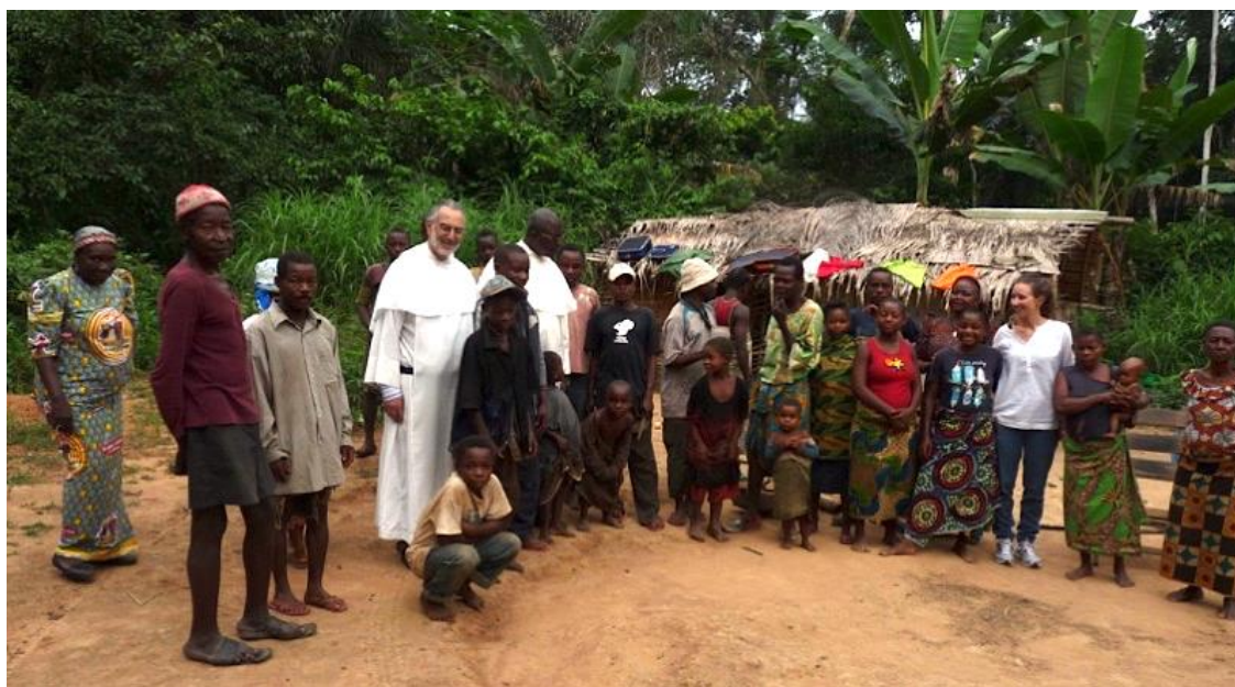
Visit of Dominicans to a Pygmy community in Isiro (DRC)