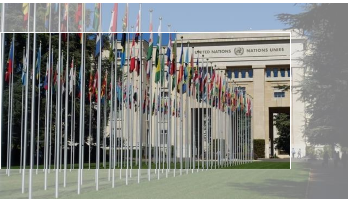
The flags at the UN in Geneva