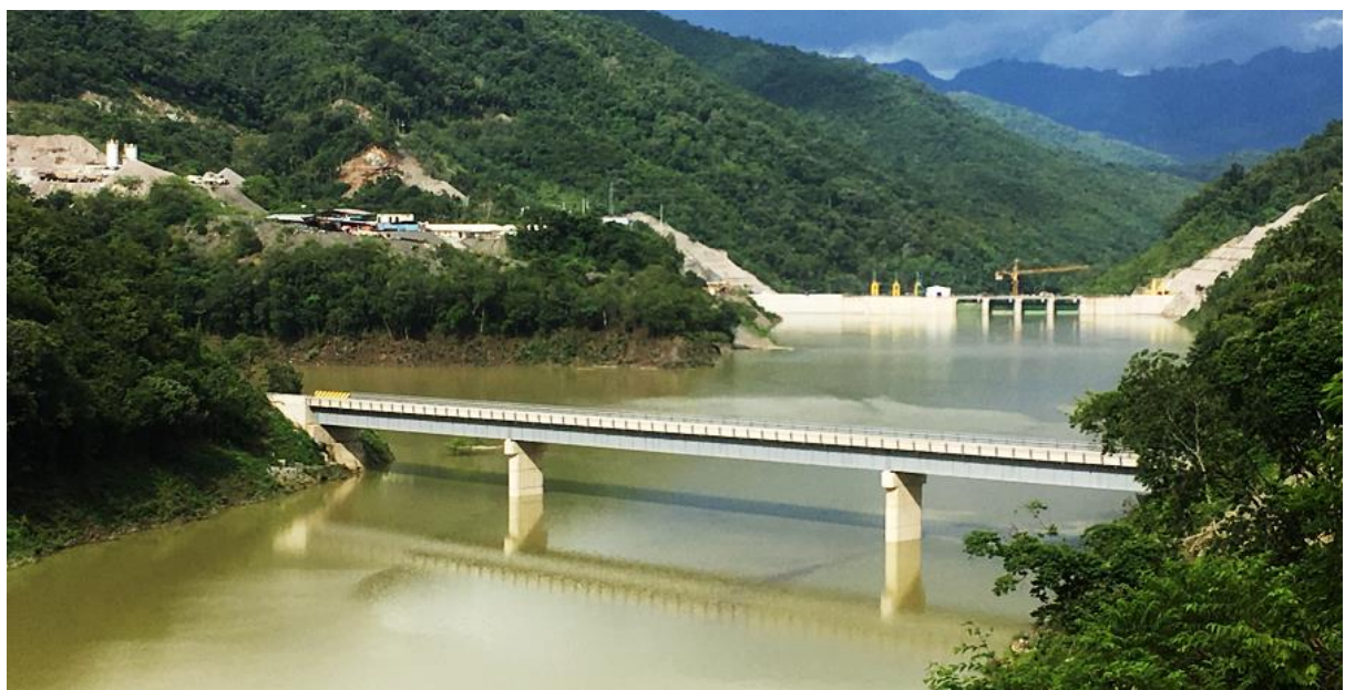
Hydroelectric project of the company Finca Oxec S.A., Cahabón (Guatemala)