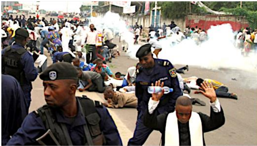
Brutal repression of peaceful protests led by religious leaders, Kinshasa (DRC)

Among the main concerns identified by the participants were the restriction of fundamental human rights and freedoms in Kinshasa, the prevailing insecurity in the province of Haut Uélé, the right to health, access to free education and the numerous violations of human rights around the exploitation of natural resources.