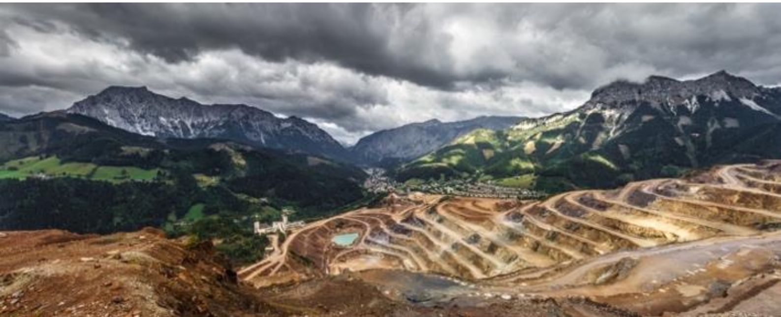
Open pit mine

Faced with this major challenge, Dominicans for Justice and Peace is addressing the problem, especially from a human rights perspective. Fed by the diverse and rich experiences of Dominicans in the fight against climate change and environmental destruction, in 2018 the Delegation at the UN level highlighted direct and indirect impacts of climate change on the effective enjoyment of human rights while putting pressure on states to adopt appropriate climate policies.