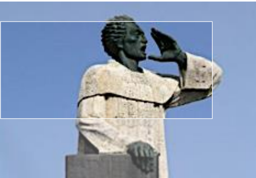
The cry of Antonio de Montesinos