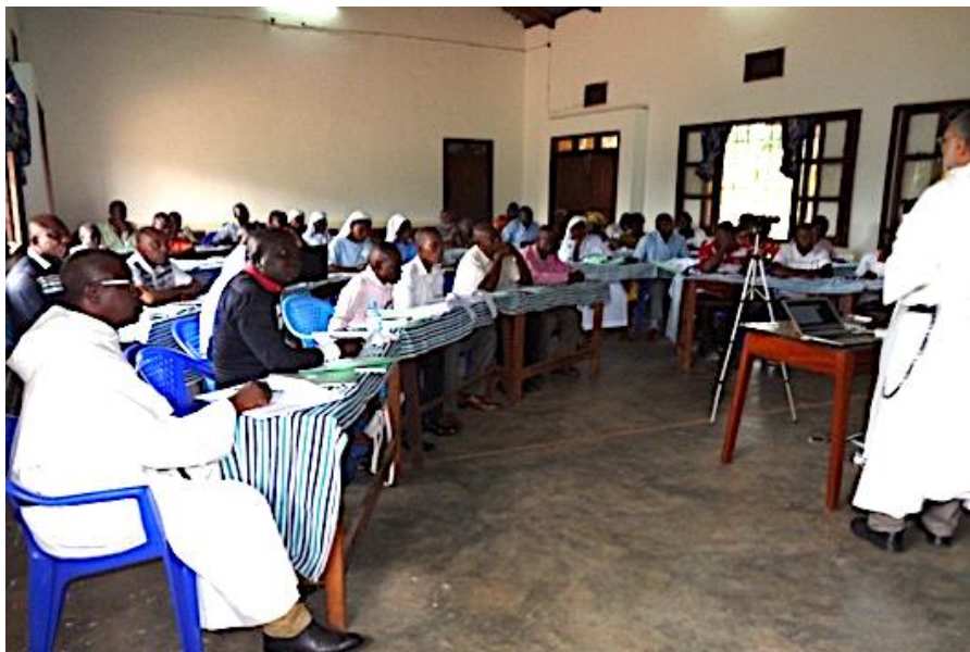
Training of Dominicans in Isiro (DRC)

Since the aim of the Delegation's advocacy is to support and consolidate the activities of Dominicans on the ground, in 2018 it was decided to expand the running of workshops at the country level to strengthen the capacity of Dominicans to work with the UN mechanisms. The Delegation hopes in this way to ensure sustainability in the advocacy of Dominicans on the ground and improve the quality of their participation at the UN in Geneva. This formation program thus emerges as fundamental to meeting the general and specific objectives of the Dominican presence in Geneva.