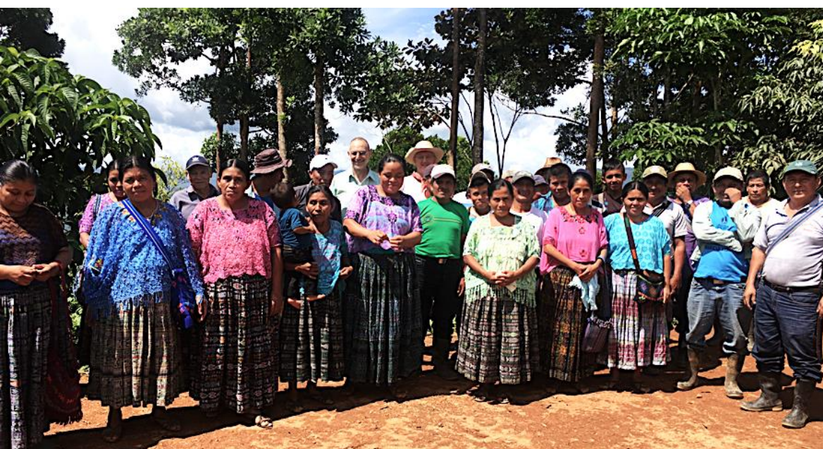
Q'eqchi' community negatively affected by the hydroelectric project, Cahabón (Guatemala)