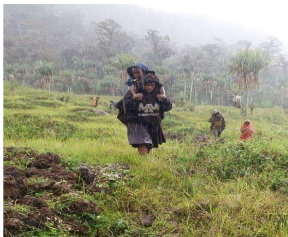
Refugees fleeing from a military operation, West Papua (Indonesia)

West Papua (comprising the two most eastern provinces of Indonesia), is one of the areas in the Asia-Pacific region which remains strongly affected by human rights abuses. These arise from the political conflict and the exploitation of natural resources for the past five decades. 2018 was marked by a considerable increase in political arrests in peaceful demonstrations as well as by an increase in the number of reported extra-judicial killings. Widespread cases of malnutrition and the high number of victims of epidemics also raised serious concerns with regard to the enjoyment of the right to health.