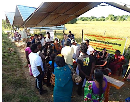
Sri Lanka demonstration in solidarity with people whose land was confiscated by the military during the war

In this context, the Delegation pursued its monitoring of the situation in the country in collaboration with Dominican friars at the local level. At the 37 th session of the HRC in March, the Delegation orally denounced the negative impacts of the Colombo International Financial City project on people's rights and on the environment. It also shared the religious community's concern about transitional justice through co-signing a statement on the slow and limited implementation of the Government's commitments on this matter.