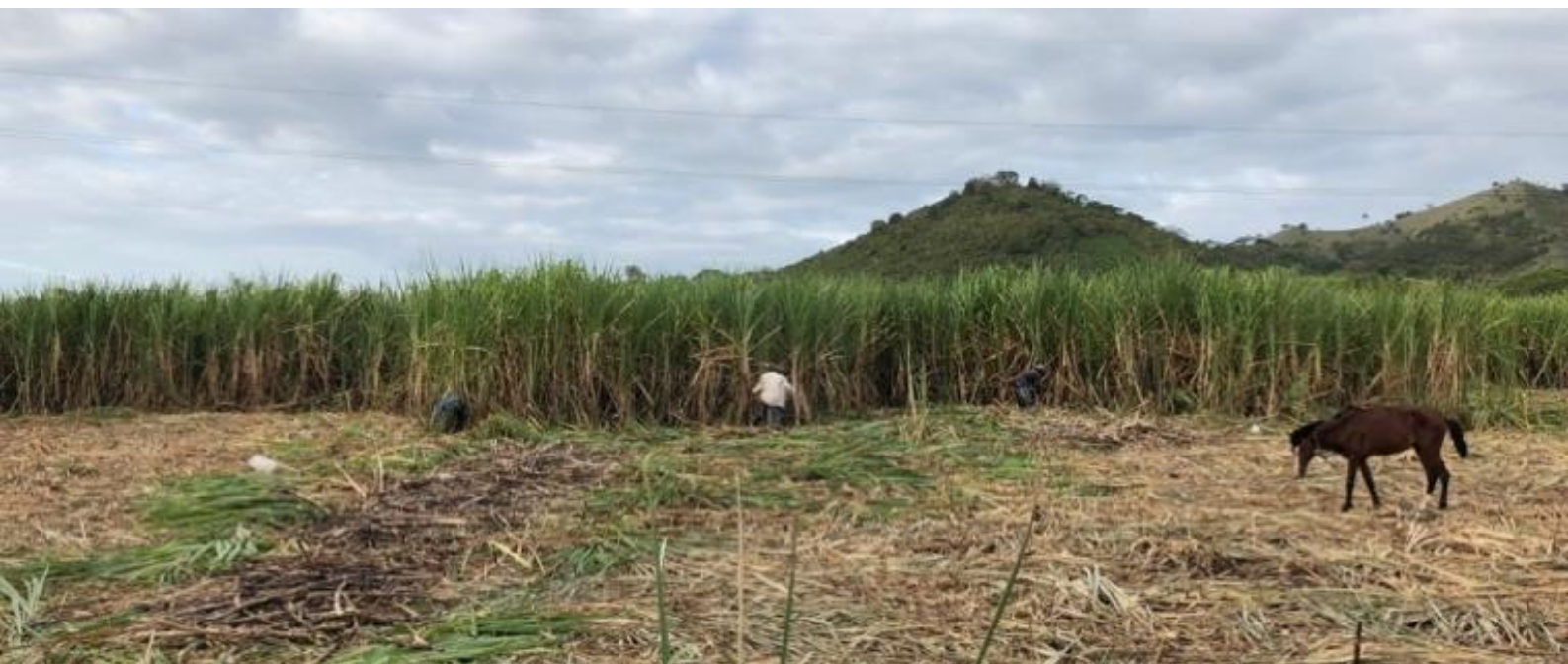
Haitians working in sugar canes fields in El Seybo (Dominican Republic)