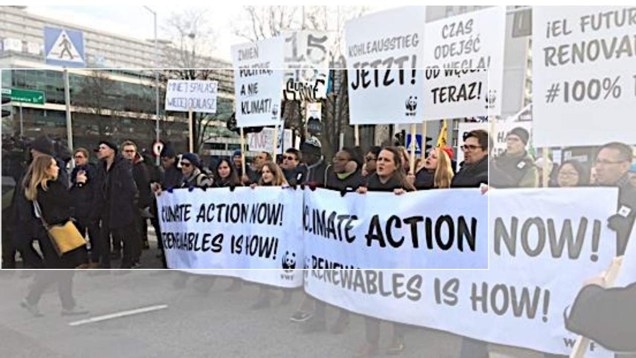
Climate march during COP24 Katowice (Poland)

Environmental destruction, especially from big business activities and artisanal mining, as well as climate change are cross-cutting issues that affect the world and future generations. More than ever in recent years, entire populations, including Dominicans, have suffered the consequences of climate change and the destruction of their environment. As pointed out by Michelle Bachelet, the United Nations High Commissioner for Human Rights, climate change has displaced 25.3 million people each year since 2008. Indigenous peoples are among the first to be affected, owing to their dependence upon, and close relationship with the environment and its resources. Climate change and environmental destruction directly affect many human rights, such as the right to a healthy environment, the right to an adequate standard of living, including the right to adequate food and housing, and the right to the highest attainable standard of physical and mental health. Human rights must therefore be at the heart of discussions on environmental protection and climate change.